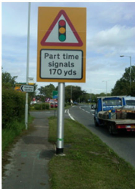
Single legged sign post