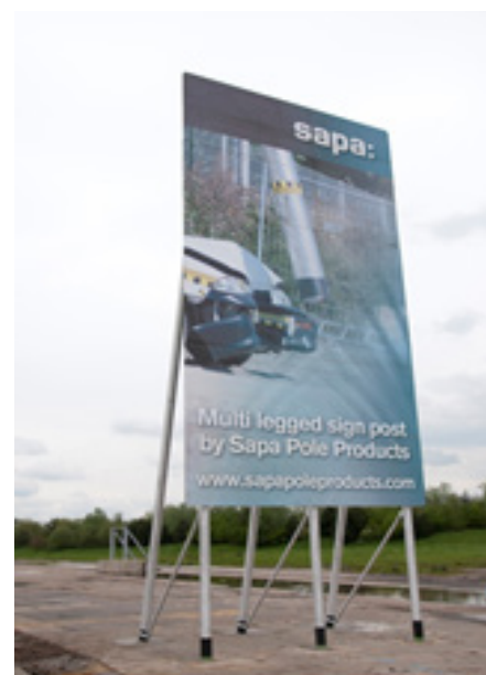
Shored-up multi legged sign post