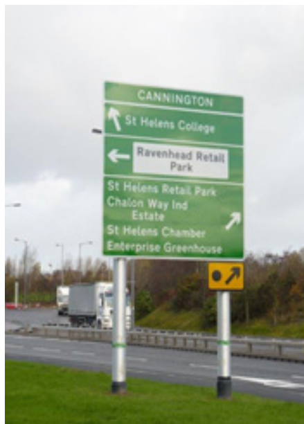
Multi legged sign post