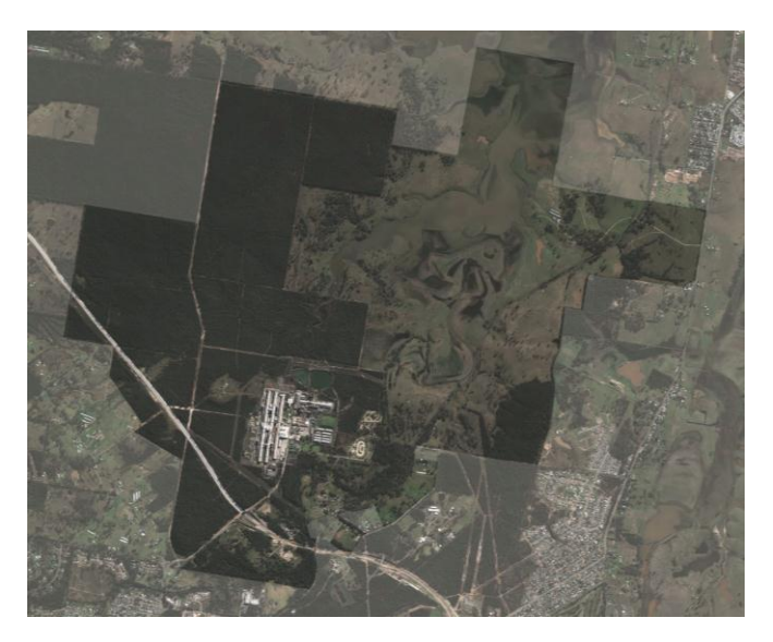
An aerial view of the smelter site and buffer zone

The northern boundary of the buffer zone is between 3.5 and 4 kilometres away from the smelter.