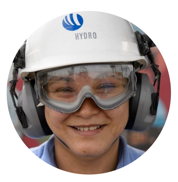
Measures and actions already initiated or implemented